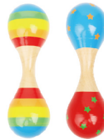
Double Maracas EF22027 Size:4.3*4.3*15cm