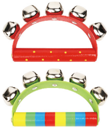
Handbell EF22021 Size:15*9*2.5cm