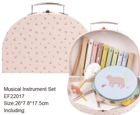
Musical Instrument Set EF22017 Size:26*7.8*17.5cm Including: Xylophone*1/Tambourine*1 Maracas*1/Triangle*1