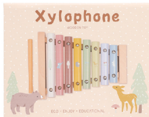
Xylophone EF22013 Packing Size: 20*3.5*15.7cm