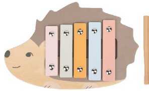
Hedgehog Xylophone EF22014 Size:15*12.5*1.8cm