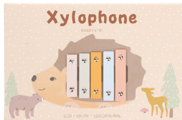
Hedgehog Xylophone EF22014 Packing Size: 23*3*15cm