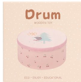
Drum EF22007 Packing Size: 16*16*8cm