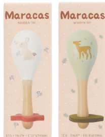
Maracas EF22011 Packing Size: 5.5*5.5*16cm