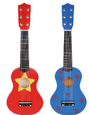
Guitar EF22032 Size:52.6*17.3*5.3cm