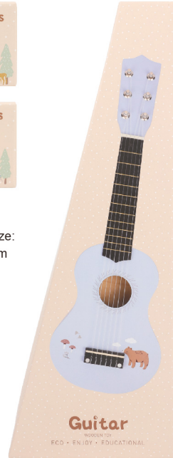
Guitar EF22015 Packing Size: 19.7*7*53cm