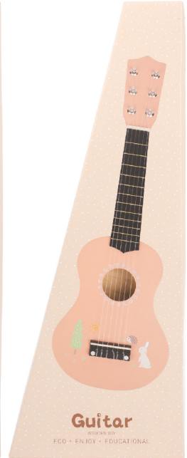
Guitar EF22016 Packing Size: 19.7*7*53cm