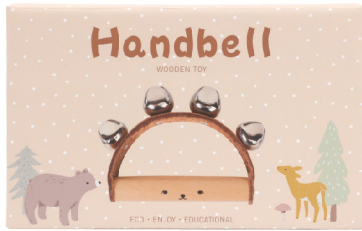
Handbell EF22001 Packing Size: 16*10*3.5cm