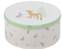
Drum EF22008 Size:15*15*7cm