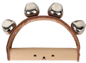
Handbell EF22001 Size:15*9*2.5cm