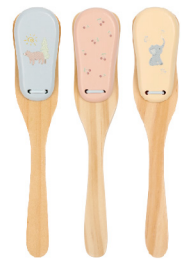
Castanets EF22004 Size:5*3*20cm