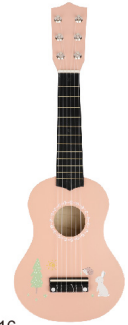
Guitar EF22016 Size:52.6*17.3*5.3cm