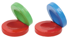
Castanets EF22029 Size:5.5*5.5*3cm