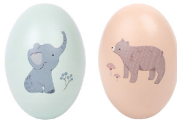
Egg Shaker EF22002 Size:5*5*7cm