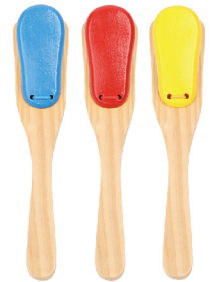
Castanets EF22024 Size:5*3*20cm