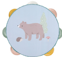
Tambourines EF22006 Size:15*15*4.5cm