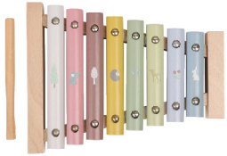
Xylophone EF22013 Size:18.8*14.7*2.3cm