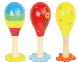
Maracas EF22028 Size:4.6*4.6*15cm