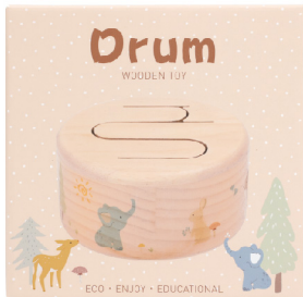
Drum EF22005 Packing Size: 16.5*16.5*9cm