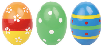
Egg Shaker EF22022 Size:5*5*7cm