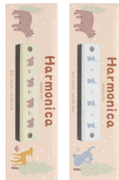
Harmonica EF22009 Packing Size: 14*4*3.5cm