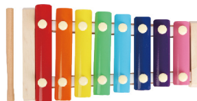
Xylophone EF22031 Size:22.8*12*2.6cm