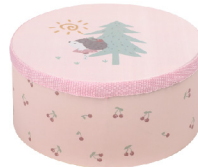
Drum EF22007 Size:15*15*7cm