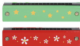
Harmonica EF22030 Size:13*3*2.5cm