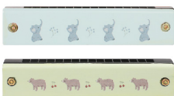
Harmonica EF22009 Size:13*3*2.5cm