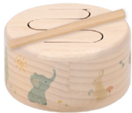
Drum EF22005 Size:15.5*15.5*8cm