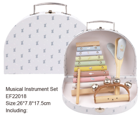
Musical Instrument Set EF22018 Size:26*7.8*17.5cm Including: Xylophone*1 Handbell*1/Castanets*1