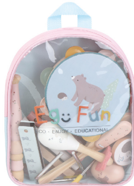
Musical Instrument Set EF22020 Size:23.2*5.5*28cm Including:Xylophone*1/Tambourine*1 Maracas*1/Harmonica*1/Flute*1 Castanets*1/Triangle*1/Egg shaker*1