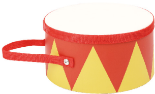
Drum EF22025 Size:17.8*10cm