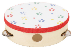
Tambourines EF22026 Size:15*15*4.5cm