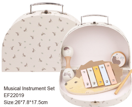
Musical Instrument Set EF22019 Size:26*7.8*17.5cm Including: Xylophone*1/Double Maracas*1/Castanets*1