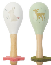
Maracas EF22011 Size:4.6*4.6*15cm