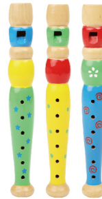
Flute EF22023 Size:2.8*2.8*20cm