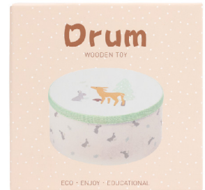
Drum EF22008 Packing Size: 16*16*8cm